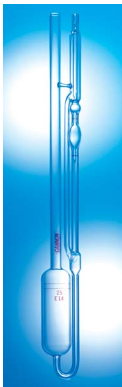
9722-L50 Series 9722-M50 Series