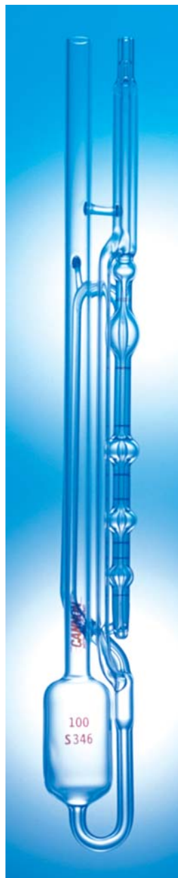
9723-L50 Series 9723-M50 Series 9723-N50 Series