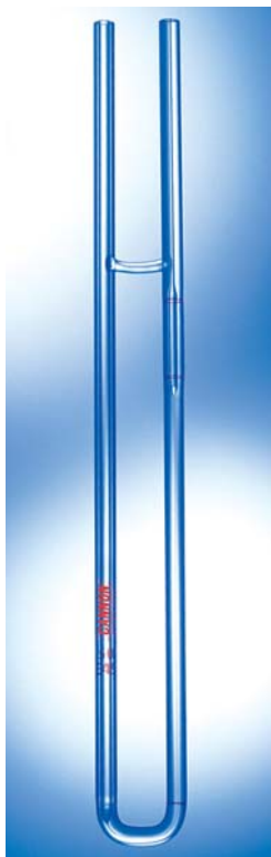
9722-C50 Series 9722-D50 Series