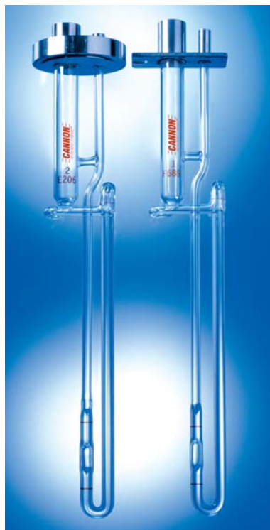
9723-W50 Series 9723-Y50 Series 9724-B50 Series 9724-D50 Series