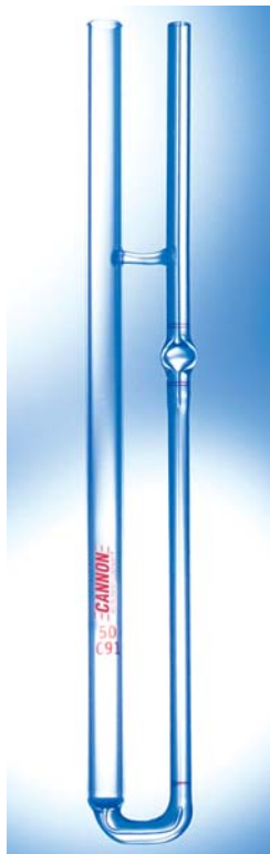
9721-X50 Series 9721-Y50 Series