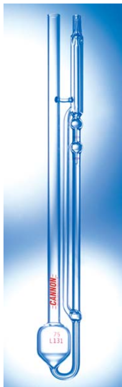
9722-G50 Series 9722-H50 Series