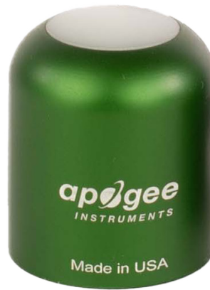
Upward-Looking S2-111-SS & S2-411-SS