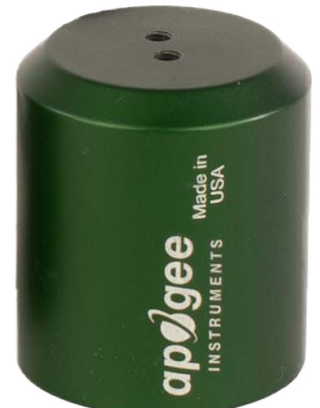
Downward-Looking S2-112-SS & S2-412-SS