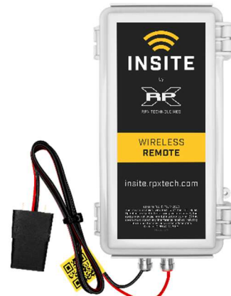
Self-Starting, 1-minute, 180-day Insite Concrete Logger connected to Wireless Remote

InSite loggers are wired to increase reliability and to reduce the per-test cost to your project