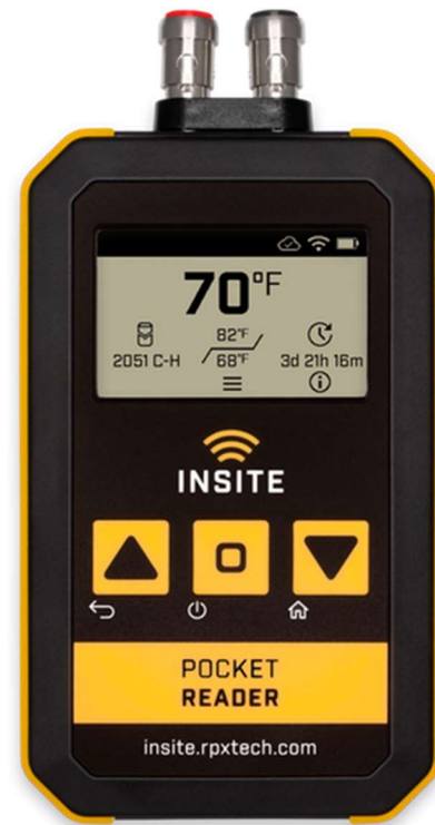
InSite Cloud Software on Wireless Device

The Pocket Reader can start loggers and can be used to spot-check the logger's current status. It can be used to view the loggers battery voltage, runtime, and firmware version. In short it can be used as your primary method of accessing, uploading and monitoring concrete data. A Pocket Reader and Loggers are all you need to start monitoring temperatures and determining concrete strengths!